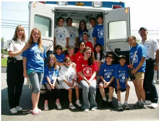
First Aid Corps Annual Poster Contest Winners

The First Aid Corps would like to thank all of the children at TBD and CDW for the wonderful posters created for the First Aid Corps' annual poster contest. Congratulations to the contest winners: