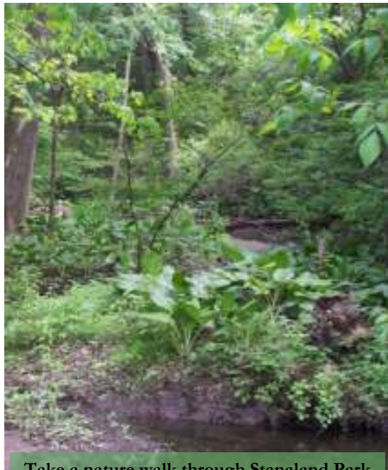
Take a nature walk through Stanaland Park

With Spring now in the air, I remind you to get outside and enjoy the outdoors. Walk along the Old Tappan reservoir or in one of our several parks. It is a special time in our special little town. Let me know how you are doing and how the Council and I can make your Old Tappan even better. We invite you to attend our meetings and witness how your elected officials manage the affairs of the borough: positively, disciplined and in a totally transparent manner. Send me an email (mayor@oldtappan.net) or send in your comments through the website (www.oldtappan.net) to any of the Borough's many departments or boards, committees, and commissions. Enjoy the season!