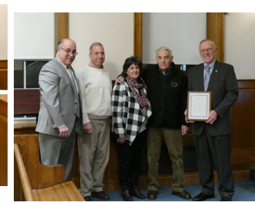
Congratulations to the Old Tappan Golf Commission Past & Present 2018 Volunteer of the Year